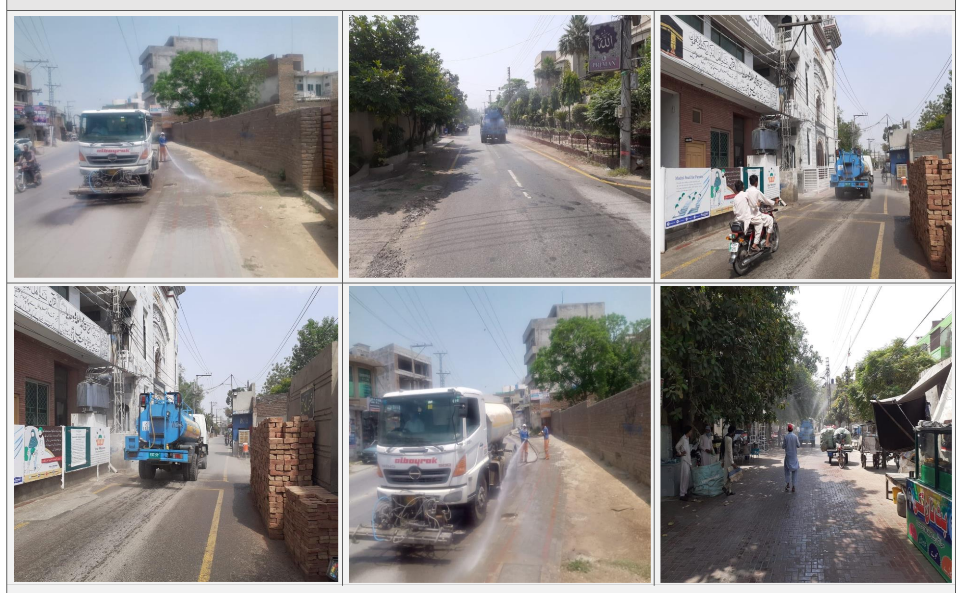
Disinfected spray by MC Rawalpindi amid prevention of COVID-19: Kohinoor City and High Court Road